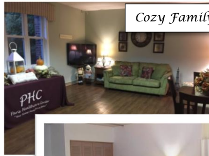
Cozy Family Areas