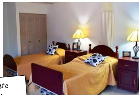
Private Suites Available